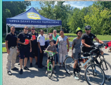
Delaware County CTSP