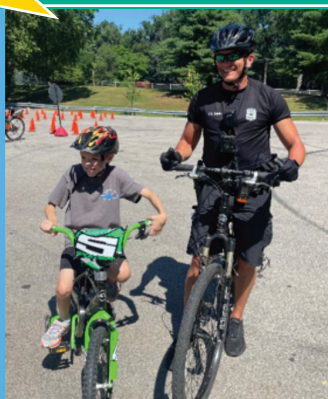
BIKE RODEO WITH UPPER DARBY POLICE ON JULY 19, 2022